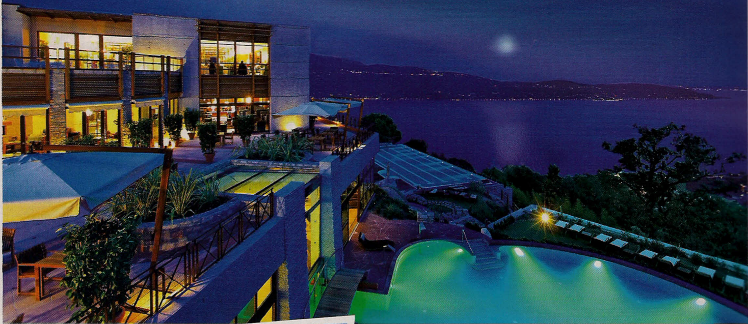
The view of Lake Garda from the spa