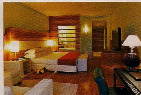
Clockwise from left: the spa's sleek, modern exterior; there's plenty of room to relax in a Prestige Junior Suite; the opulently decorated steam room; the indoor pool is connected to the infinity pool outside