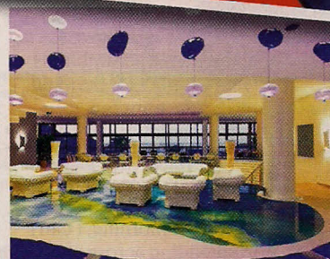
Above: a tranquil place to relax and unwind. Below: choose from Eastern and Western treatments