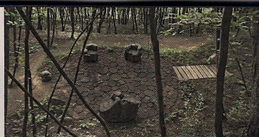
Clockwise from left: the summery Red Phoenix garden; the Green Dragon meditation area; fine dining at Lefay's La Grande Limonaia; the food is healthy and delicious