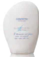
Content 50 ml Price € 16,00

Soothing, softening and protective cream based on Olive Oil and Ivy; its active principles are useful against environmental stress and skin ageing. Fast absorbing cream, leaves the skin soft and smooth.