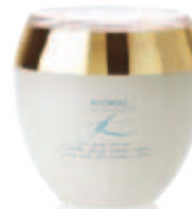
Content 200 ml Price € 70,00

Oil Microspherules massaged onto the body delicately exfoliate, leaving the skin soft and smooth. At the same time, the extracts of Lavender and Burdock purify, releasing toxins and impurities from the skin, helping cell renewal. It revives tired skin, giving vitality and a "healthy effect". Apply onto the skin, massage and remove the residue with water.